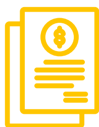
Expense Reimbursement Fraud